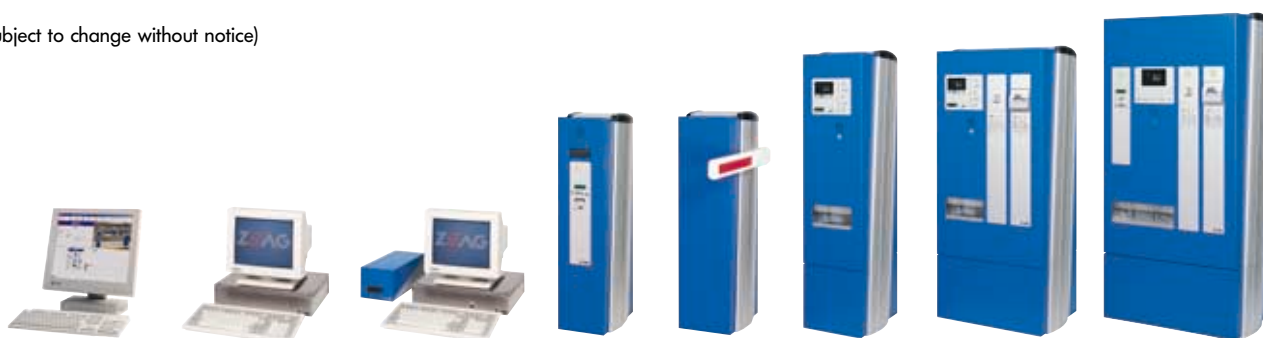
Management System ZMS Management Station Cashier Terminal Entry/Exit Station Barrier Gate Payment Station PKB Payment Station PKC Payment Station PK