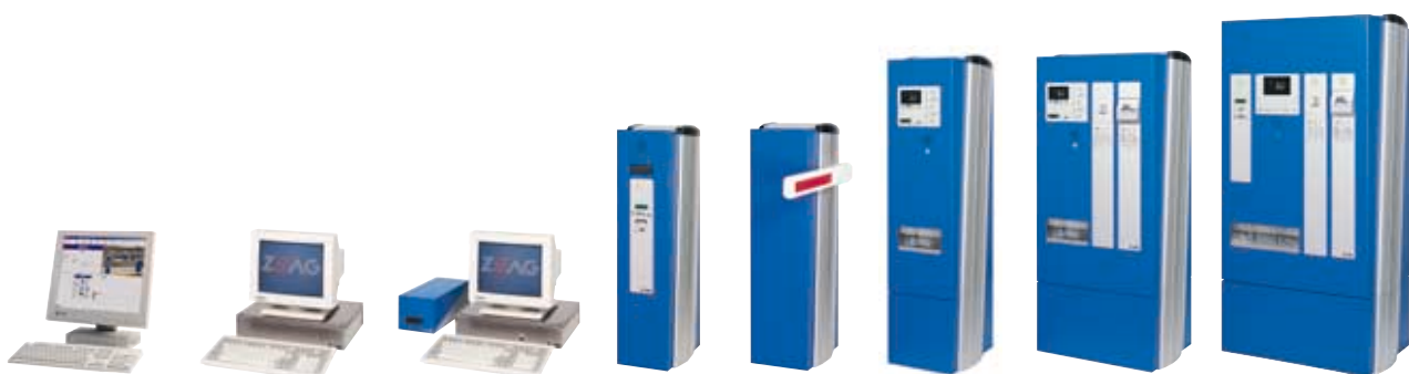
Management System ZMS Management Station Cashier Terminal Entry/Exit Station Barrier Gate Payment Station PKB Payment Station PKC Payment Station PK